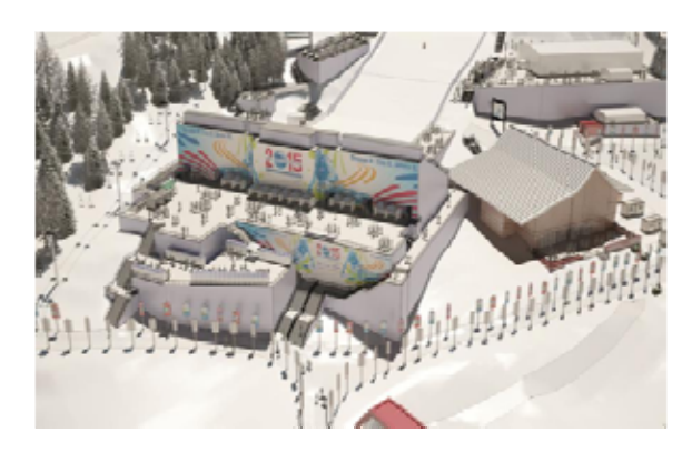
Beaver Creek Stadium