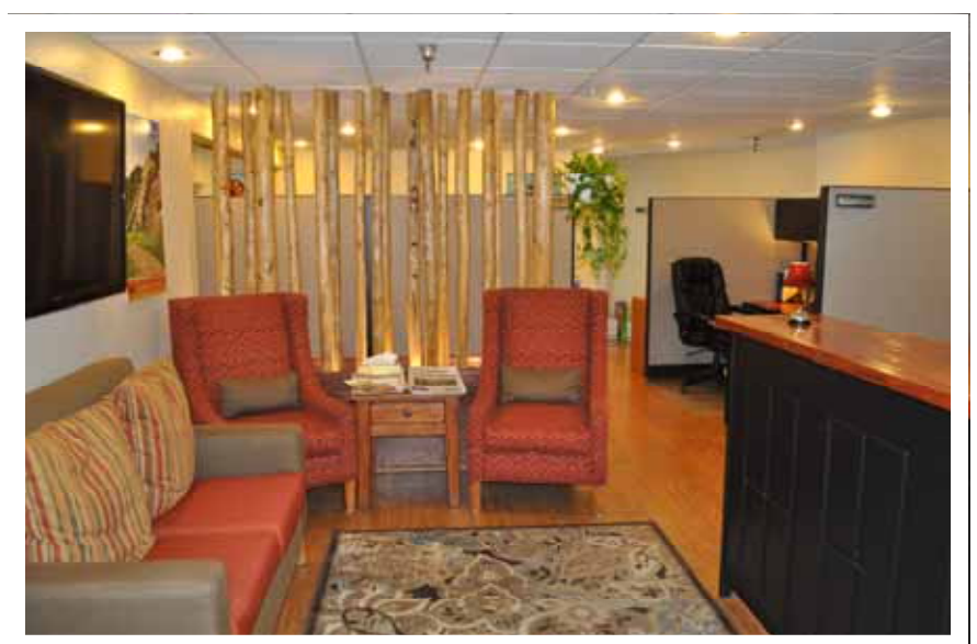
Vacation & Owner Services Reception Area