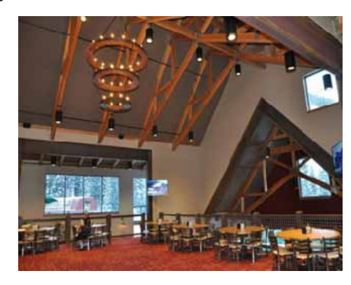
Remodeled Talons Restaurant

To host such an event is not only a great honor for the Vail Valley community and the State of Colorado, but a great opportunity to rally the nation around the sport of skiing and engage the next generation.